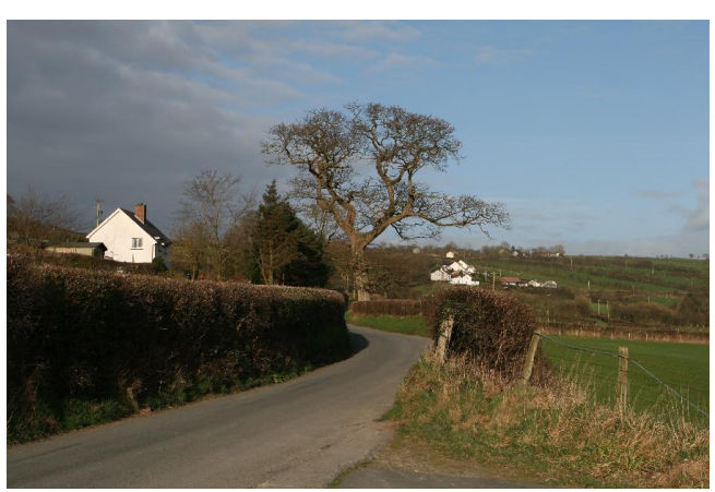
This document was produced on November 9, 2009.

Continue along this road for almost 1 kilometre.